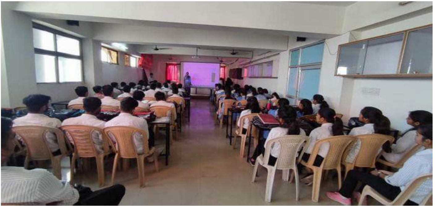
World Bicycle Day was Celebrated on 3 rd June 2022